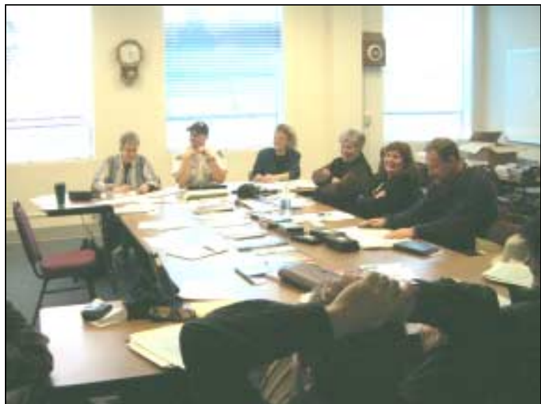
November 2004, Josephine County Integrated Fire Plan, Education and Outreach Committee Meeting.

CWCH has developed key partnerships with federal and state agencies, and private sector and community groups. State and federal partners include the National Fire Plan Director for Oregon and Washington, Bureau of Land Management, Oregon Departments of Forestry, State Fire Marshal, Emergency Management and Land Conservation and Development. We have also partnered with community and environmental groups, watershed councils, large-scale landowners, and social service organizations.