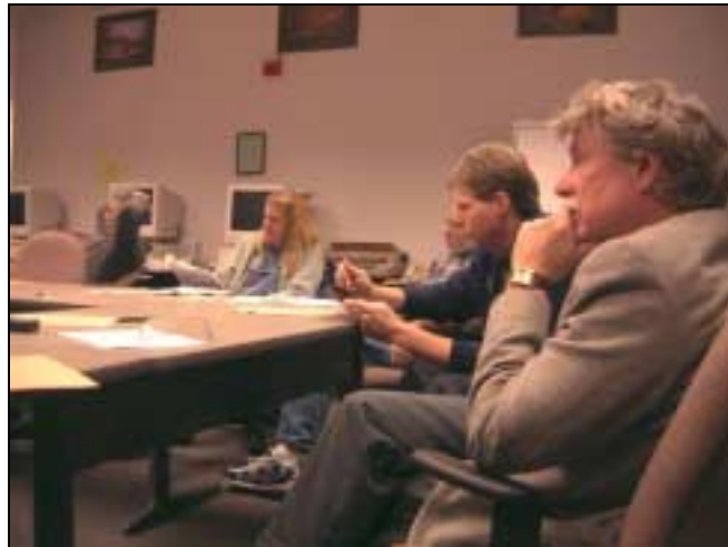
Josephine County Integrated Fire Plan Executive Committee Meeting, December 2003

Josephine County has the sixth highest incidence of poverty in the state of Oregon, with 15% of the population at or below the Federal Poverty Level.